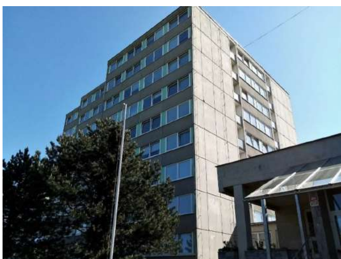
The student residence of the University of West Bohemia, Plzeň

Lochotín student residence, where the Event Centre is also located, will be the primary site for accommodation. This complex of two interconnected nine-storey buildings is the largest student residence in Plzeň, located on Bolevecká street 30, close to Tram 1 and 4 stop Pod Záhorskem, not far from the city centre.