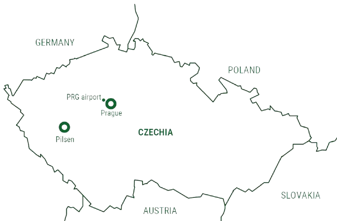
General map of the region, JWOC area, Event Centre and airport

Pilsen also has a significant cultural significance. There are numerous cultural houses and theatres. Higher education is represented by the University of West Bohemia and the Faculty of Medicine of Charles University. In 2015, Pilsen (together with Mons in Belgium) was the European Capital of Culture.